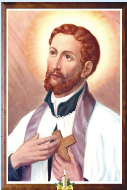
St. Francis Xavier