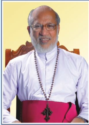
His Excellency Mar George Alencherry (Major Archbishop of Ernakulam-Angamaly)